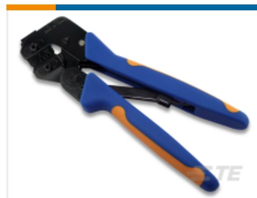
TE Model / Part # 58495-1 PRO CRIMPER ASSY MULTIMATE