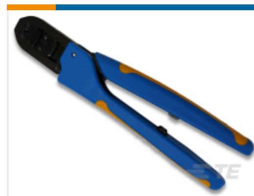
TE Model / Part # 91523-1 CERTICRIMP 2,SAHT III+