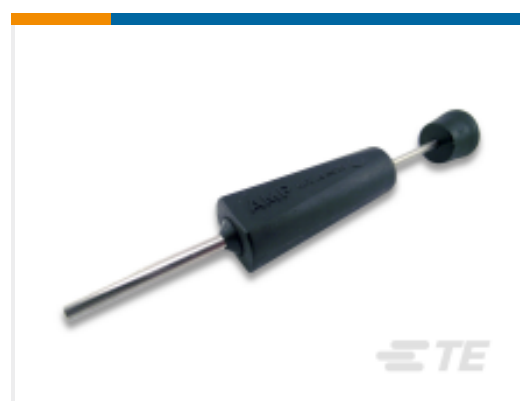
TE Model / Part # 305183 EXTRACT TOOL TYPE 2 20-16