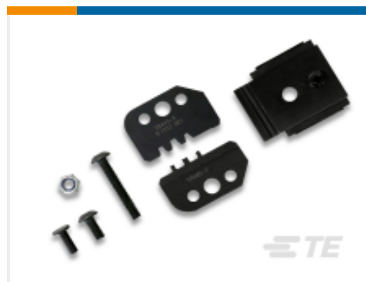
TE Model / Part # 58495-2 PROCRIMPER DIE ASSY MULTIMATE