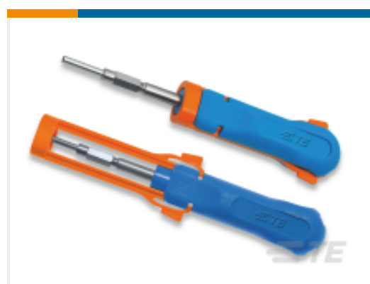
TE Model / Part # 539972-1 EXTRACTION TOOL