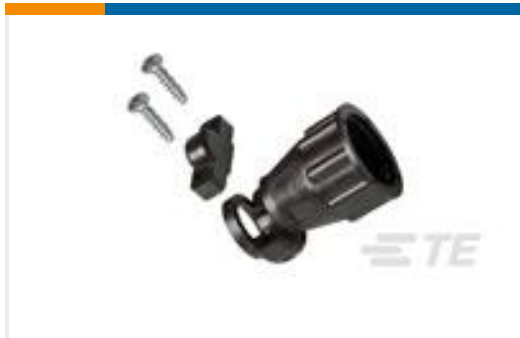
TE Model / Part #1-206062-6 CABLE CLAMP KIT #11