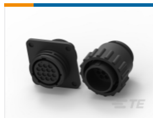
TE Model / Part # CAT-AM71-C83998K CPC SERIES 6