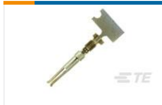
TE Model / Part #66504-9 SOCKET CONTACT, 20 DF