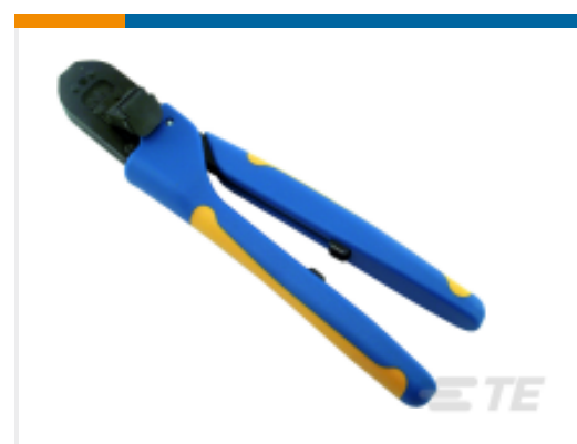
TE Model / Part # 91523-3 CERTICRIMP 2,SAHT TYPE III+