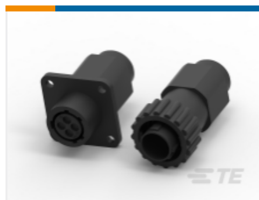
TE Model / Part # CAT-AM71-C83998Y CPC SERIES 1 SEALED ONE-PIECE