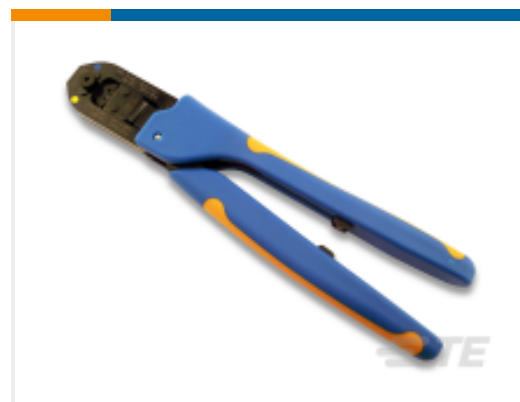
TE Model / Part # 91505-1 CERTICRIMP 2,SAHT TYPE III+