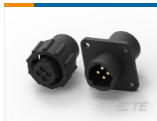
TE Model / Part # CAT-AM71-C83998J CPC SERIES 1