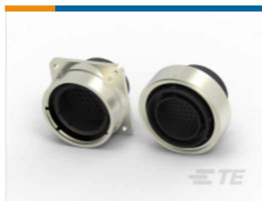
TE Model / Part # CAT-AM71-C83998C CMC SERIES 1