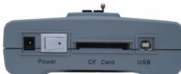
Back view of the programmer.

Requires a « Compact Flash » card 64, 128 or 256 Mb to use it in stand-alone mode.