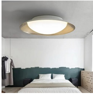
slim led driver for ceiling light