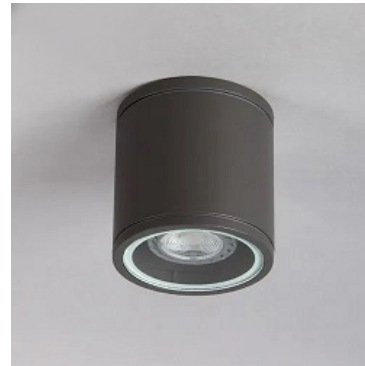
36w 750ma led driver for downlight