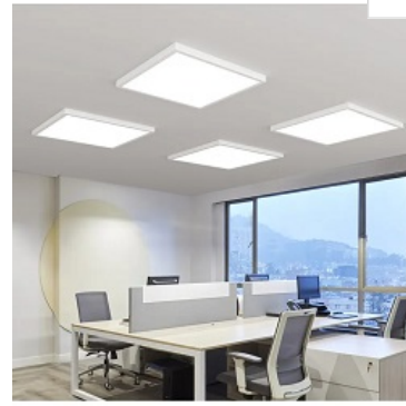
driver led 36w for panel light