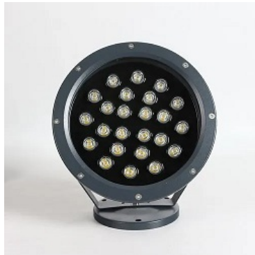
led driver 750ma for project light