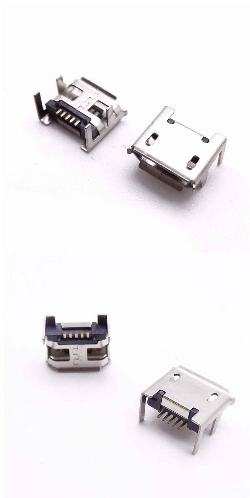
MICRO USB 5P female seat B type 7.2 four-pin board foot length 1.3 with column curling