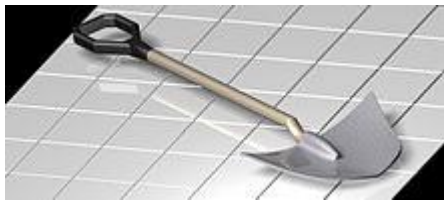
Shovel created on Solid Edge

An assembly is built from individual part documents connected by mating constraints, as well as assembly features and directed parts like frames which only exist in the Assembly context. Solid Edge supports large assemblies with over 1,000,000 parts.