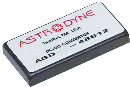
Unit measures 1"W x 2"L x 0.25"H