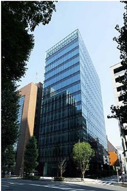
Headquarters in Toranomon First Garden