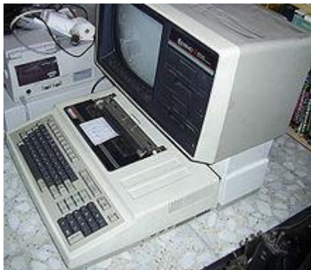
BMC IF 800 20 03 (1982)