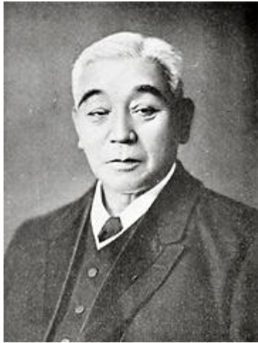
Asano Soichiro of Asano zaibatsu

exchanges as phones became more common. [7] Asano Soichiro of Asano zaibatsu elected chairman in 1912. [8]