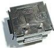
Alps SKBM Grey switch