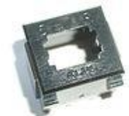
Alps SKBM Grey switch backside with old logo