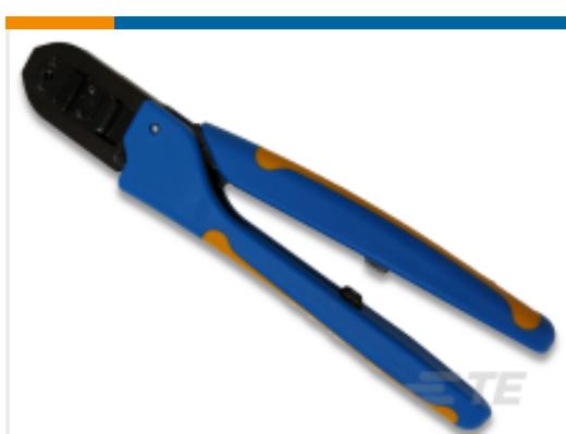
TE Model / Part # 91519-1 CERTICRIMP 2, SAHT TYPE III+