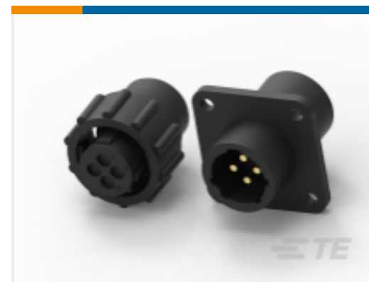
TE Model / Part # CAT-AM71-C83998J CPC SERIES 1