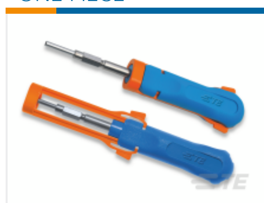
TE Model / Part # 539972-1 EXTRACTION TOOL