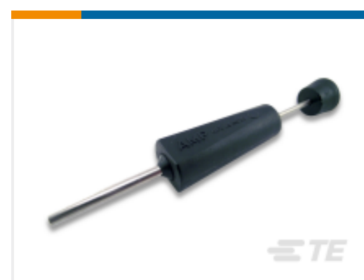
TE Model / Part # 305183 EXTRACT TOOL TYPE 2 20-16