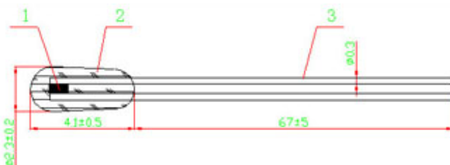
MF58J • 1---chip, 2---glass encapsulation, 3---lead wire