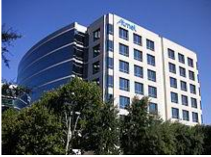
Atmel corporate headquarters in San Jose California