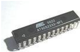
Atmel AT90S2333 microcontroller