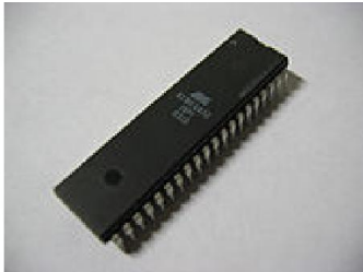
Atmel ATMEGA32 microcontroller

A large part of Atmel's revenue is from microcontrollers. These include the AVR 8- and 32-bit microcontrollers, ARM architecture microprocessors, and ARM-based flash microcontrollers. In addition Atmel still makes microcontrollers that use the 8051 architecture, albeit improved to do single-cycle instructions. Supporting the microcontrollers is the Atmel Studio 7 integrated development environment which Atmel offers for free. They also provide an Atmel Software Framework. [31]